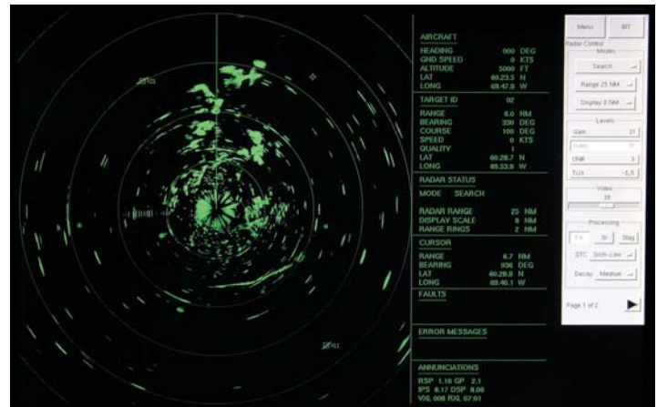
Typical RDR-1700B TDMS Display