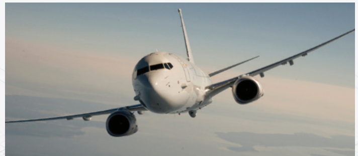
Indian Navy P-8I long-range, multi-mission maritime patrol aircraft.