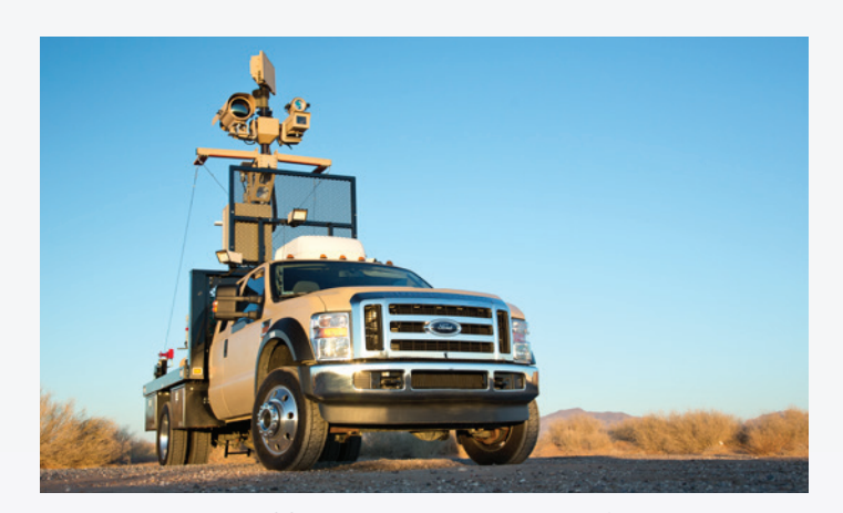
ARSS integrated on Telephonics' RaVEN®-Mobile Surveillance Capability (MSC)