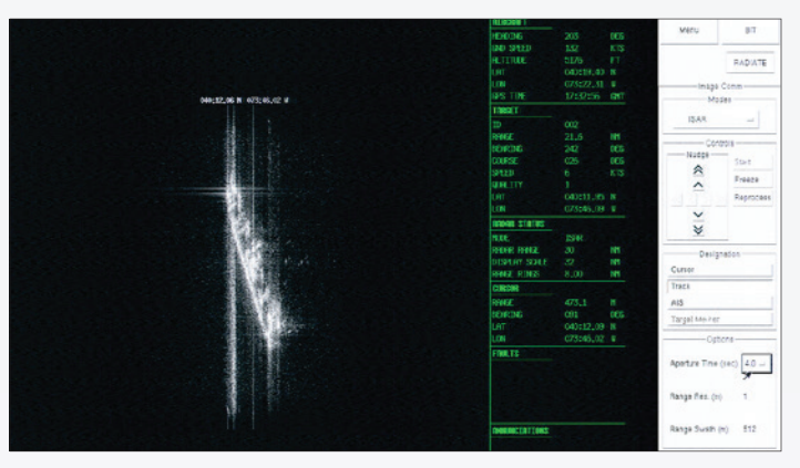
RDR-1700B ISAR image.

With a solid-state transmitter, the radar system provides higher power output and reliability at a small fraction of the cost of competing technologies. On the RDR-1700B model our solid-state transmitter offers markedly lower weight and higher power conversion efficiency over other technologies. As a result, the systems require less than 1 kw of electrical power from the platform.