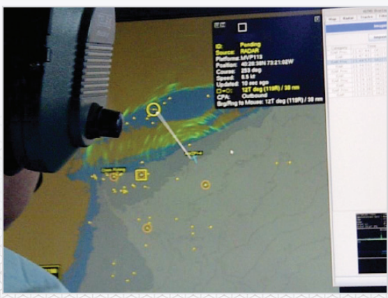
RDR-1700G(V)2 SHARC display during ISAR collection.