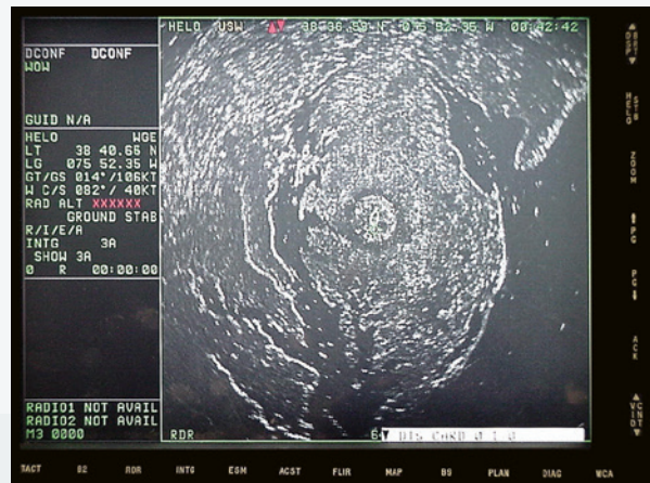
Inverse Synthetic Aperture Radar (ISAR) Imaging