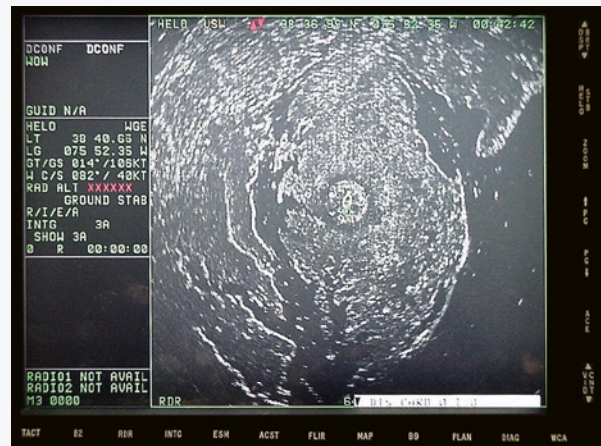
Inverse Synthetic Aperture Radar (ISAR) Imaging