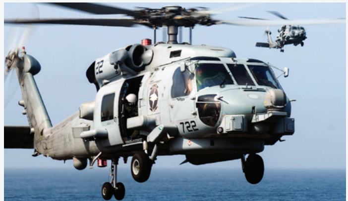
U.S. Navy MH-60R Multi-Mission Helicopter

The MH-60R, combined with the AN/APS-153(V), is designed to operate from helo-capable small combatants to the largest aircraft carriers as a key element in the helicopter-ship system. Via the aircraft's C-band data link, shipboard personnel have virtually the same radar picture as the flight crew. The radar will withstand the harshest maritime and helo-vibration environments.