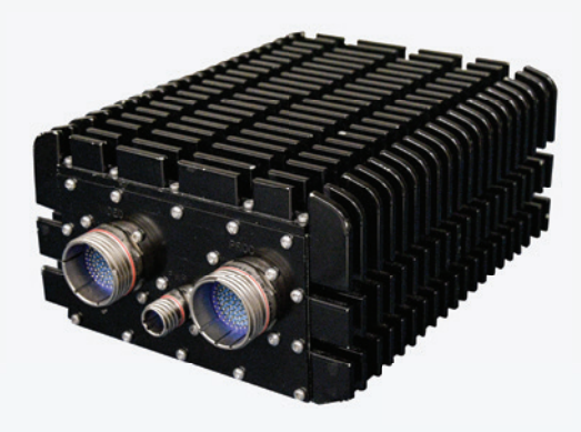
MCA External Rugged Computer