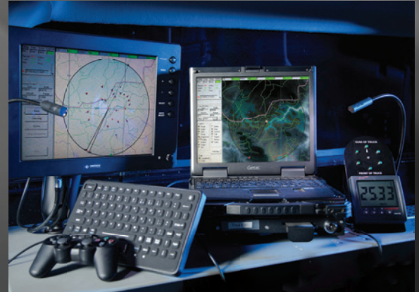
Command & Control Station (C 2 )

For additional information, contact Telephonics at 631.755.7000 or visit www.telephonics.com .