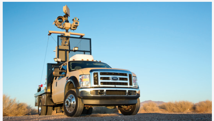
RaVEN ® -Mobile Surveillance Capability (MSC)

Telephonics provides detailed user support for both the ThreatSTALKER C 2 system and the sensor suite, enhancing operator effectiveness. Operators receive classroom instruction, as well as hands-on field training and support to ensure successful operations.