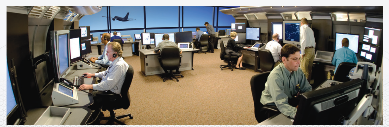
Superior target reporting for civil ATC applications

For additional information, contact Telephonics at 631.755.7000 or visit www.telephonics.com.