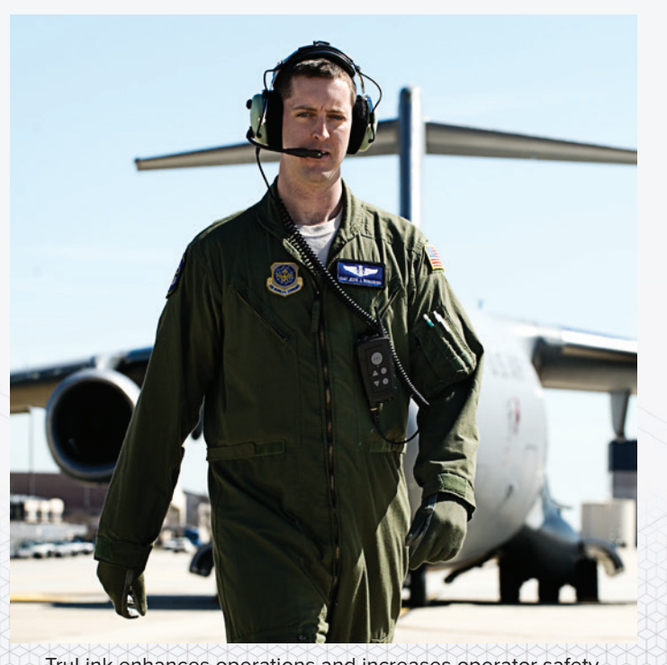
TruLink enhances operations and increases operator safety.