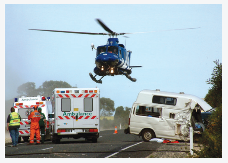
TruLink is trusted by military and commercial users.