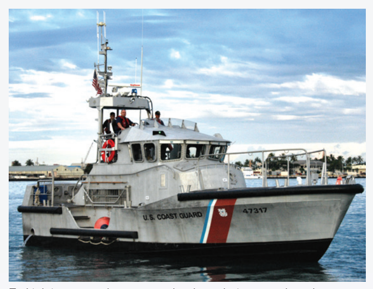
TruLink is a trusted, proven technology during search and rescue operations.