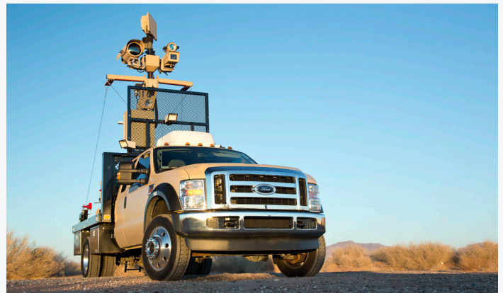
ARSS integrated on Telephonics' RaVEN®-Mobile Surveillance Capability (MSC)